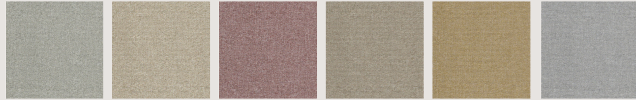
Lund - Ash