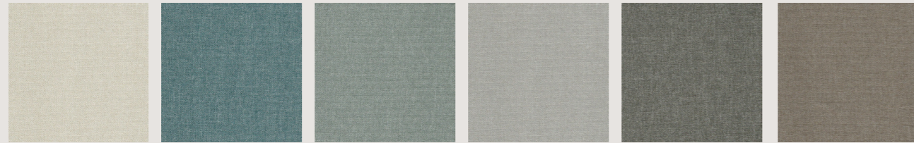
Lund - Linen