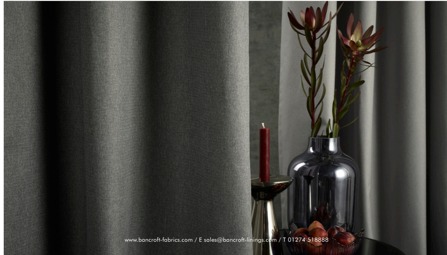
Lund - Stone

www.bancroft-fabrics.com / E_sales@bancroft-linings.com / T 01274 518888